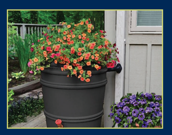
Rain Barrels for Sale SAVE EVERY DROP ... Pg. 4

Edible Gardening A HEALTHY CHOICE ... Pg. 2