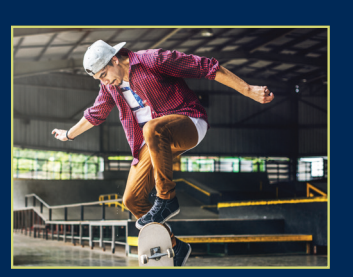
BMX and Skate Jam FUN FOR THE FAMILY ... Pg. 5