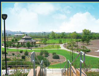
Riverwalk Park SOMETHING FOR EVERYONE ...Pg. 3