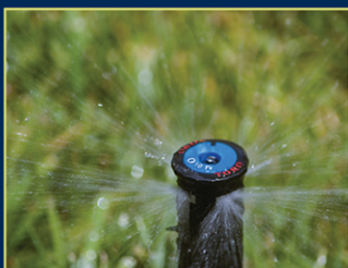
Free Sprinklers LAST CHANCE ...Pg. 6