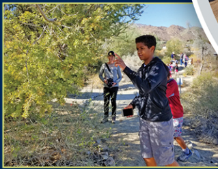
Agents of Discovery DEBUTS ON EARTH DAY ...Pg. 2