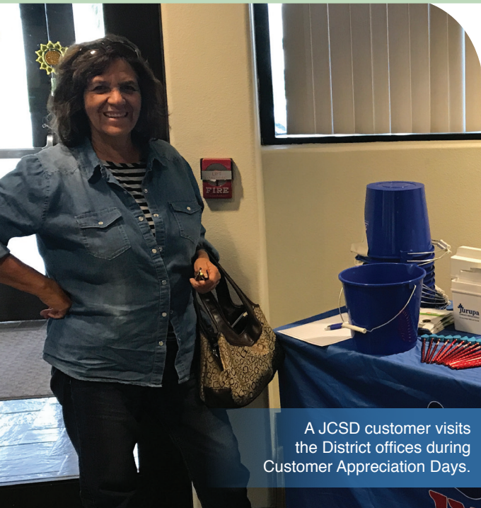
A JCSD customer visits the District offices during Customer Appreciation Days.

JCSD held its first annual Customer Appreciation Days to celebrate those we serve. About 350 customers who stopped by the District's Harrel Street offices were able to select a free water-saving gift such as a hose nozzle, a water pitcher, and a bucket for capturing water while the shower warms up.